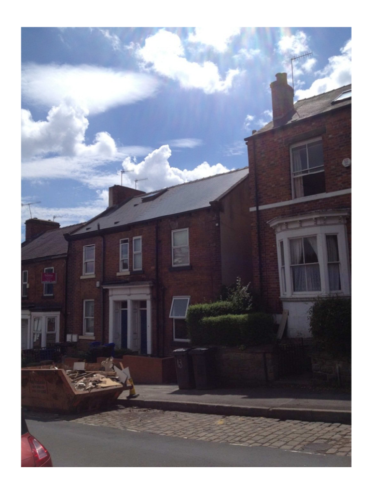
Appendix C - Photo of roof covering at 13 College Street 2010